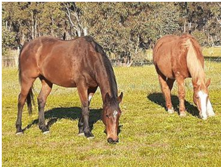
Echo in his new home