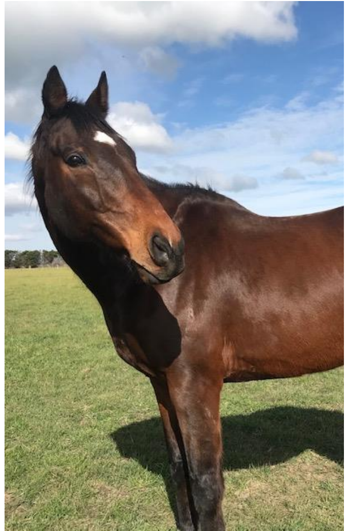
PH horse Phillipe (Big Phil)

If you have Face Book, don't forget to join our Face Book Members Page to receive updates on PH horses as well as the latest information on all of our horses available for short term and long term care.