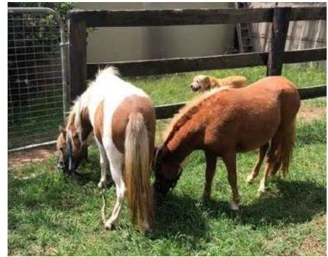
Mini mares Renni and Marnica, happily grazing on their first day.