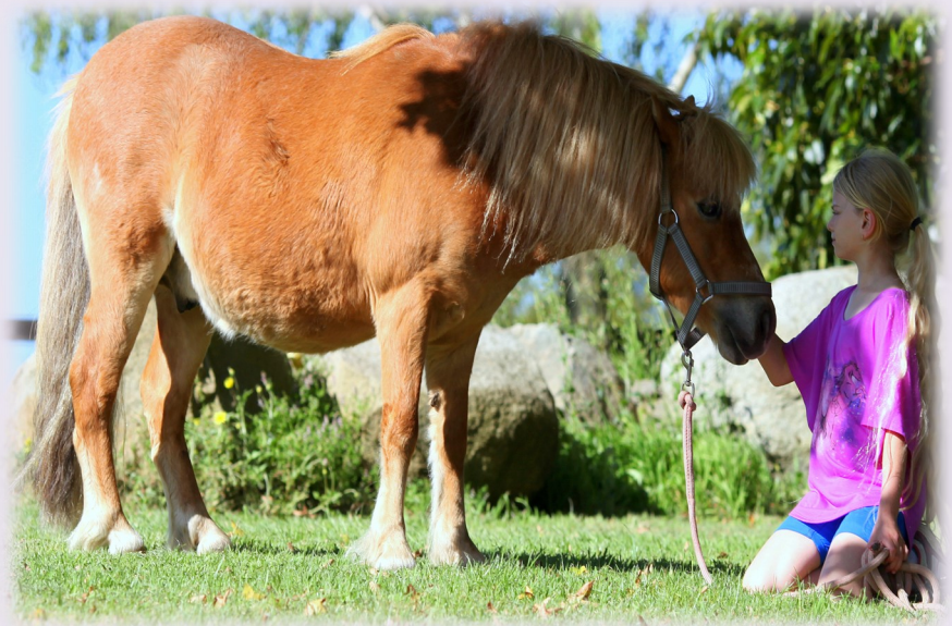
Dr Dakota and young friend

In 2009 I set up the first Equine Assisted Clinical Psychology practice in Australia. My vision was to help children and horses grow together. I was a Doctor of Clinical Psychology of 20 years and had recently trained with Equine Psychotherapy Victoria. This therapy was new and I contacted PHHWV seeking potential therapy ponies. Dr Dakota, a Shetland gelding, came to me from that contact. My dream pony; cheeky, sensitive and intuitive. Dakota has touched the hearts of children and adults and is able to pick up on PTSD, anxiety and depression and react in ways that support the clients that he and I work with. The herd expanded when PHHWV Opal found her LTC home with us. An 18 month old filly, she came to us as a companion for my young colt. My husband had recently lost his father and had shut down. Opal went up to him on Day 1, put her head on his chest and breathed with him to calm him – he came back to us. Opal has a place here forever and is now an amazing therapy mare. PHHWV Abby was rescued in a large-scale operation in Victoria. An eccentric little mare with a touch of anxiety and an instinct for connecting with children with trauma and ADHD. I have found these horses with a history of trauma to be forgiving, genuinely open to human contact and provide great support to my clients. I thank PHHWV every day for these wonderful horses.