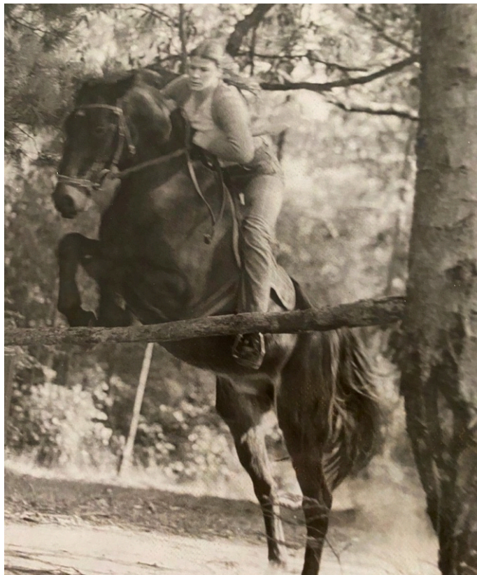
Suzanne: We obviously weren't too big on safety in the 70s - no hat. How things have changed!